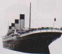
Float Your Boat A cruise for every niche p87